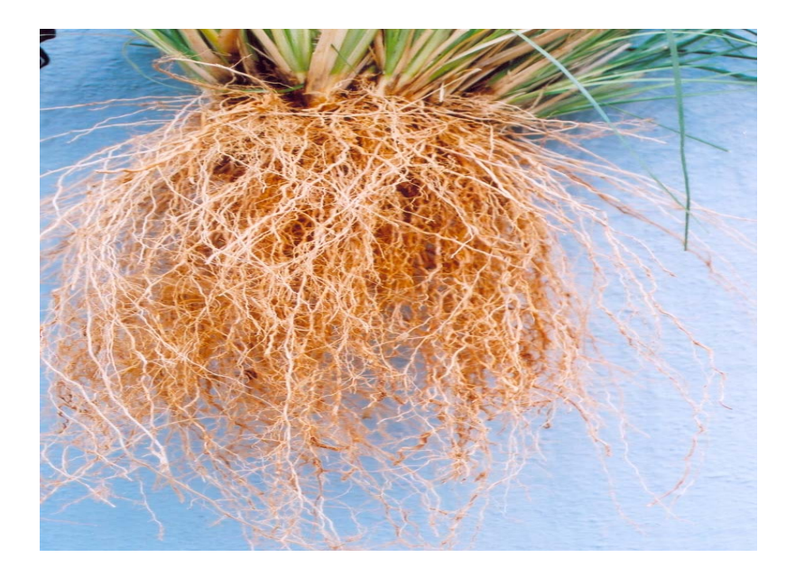
Figure 2. A sample vetiver root system after 18 months, showing substantial growth in spread as well as length compared to those after 8 months (Figure 1).the large mass and length of root (~30 cm) make vetiver efficient in sequestering carbon in soil.

The higher SOR of vetiver makes it a larger reservoir of carbon; further, the total root mass of vetiver at maturity can be much higher (Figure 2), with significantly longer (deeper) root length than either lemongrass or palmarosa.