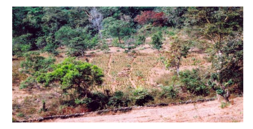
Figure 4. Vetiver plantation in interspaces of a social forestry system in western Ghats region of south India . Such sites provide non-obstructive, eco-friendly implementation of vetiver plantation for carbon sequestration.