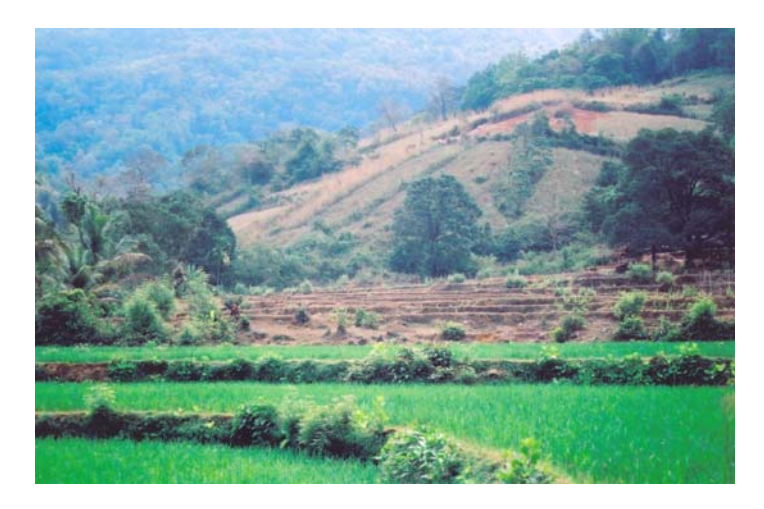
Figure 5. Vetiver cultivation near forests on hill slopes (rice cultivation in the foreground) in western Ghats area of south India. Vetiver has been incorporated in the existing cropping systems of this region for both economic and environmental benefits( Prakasa Rao et al., 2008)

However, in systems which warrant harvest of vetiver roots for essential oil, alternate strategies such as incorporation of vetiver in agro-forestry systems, in field boundaries, in degraded lands, recycling of vetiver residues need to be adopted to sequester carbon.